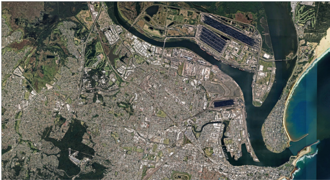
Figure 4-1: Regional Context of Proposed Site.