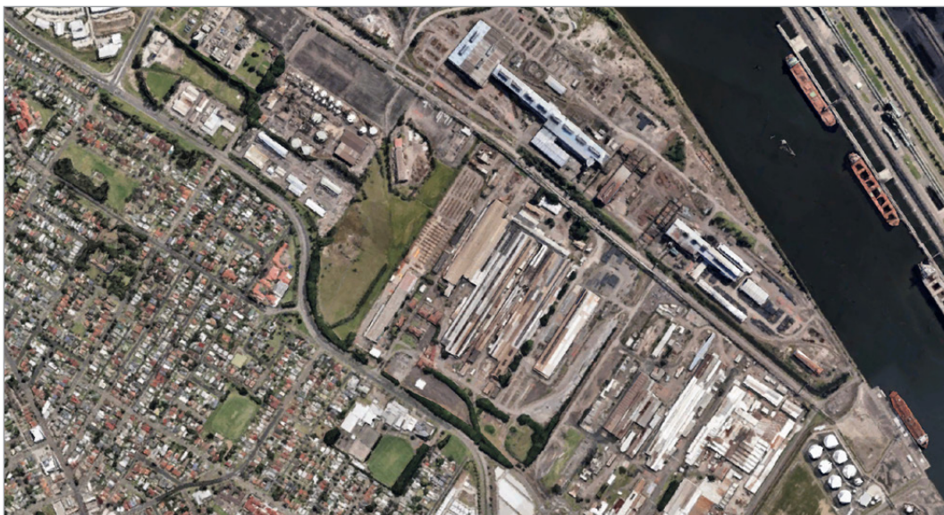
Figure 4-2: Local Context of Site.