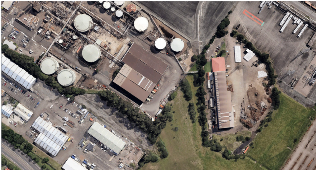
Figure 4-3: Site layout.