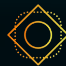
Consulting & training